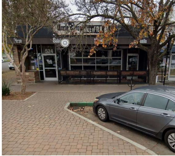
Figure 2 – Current Street View (Google Earth 6/09/2023)